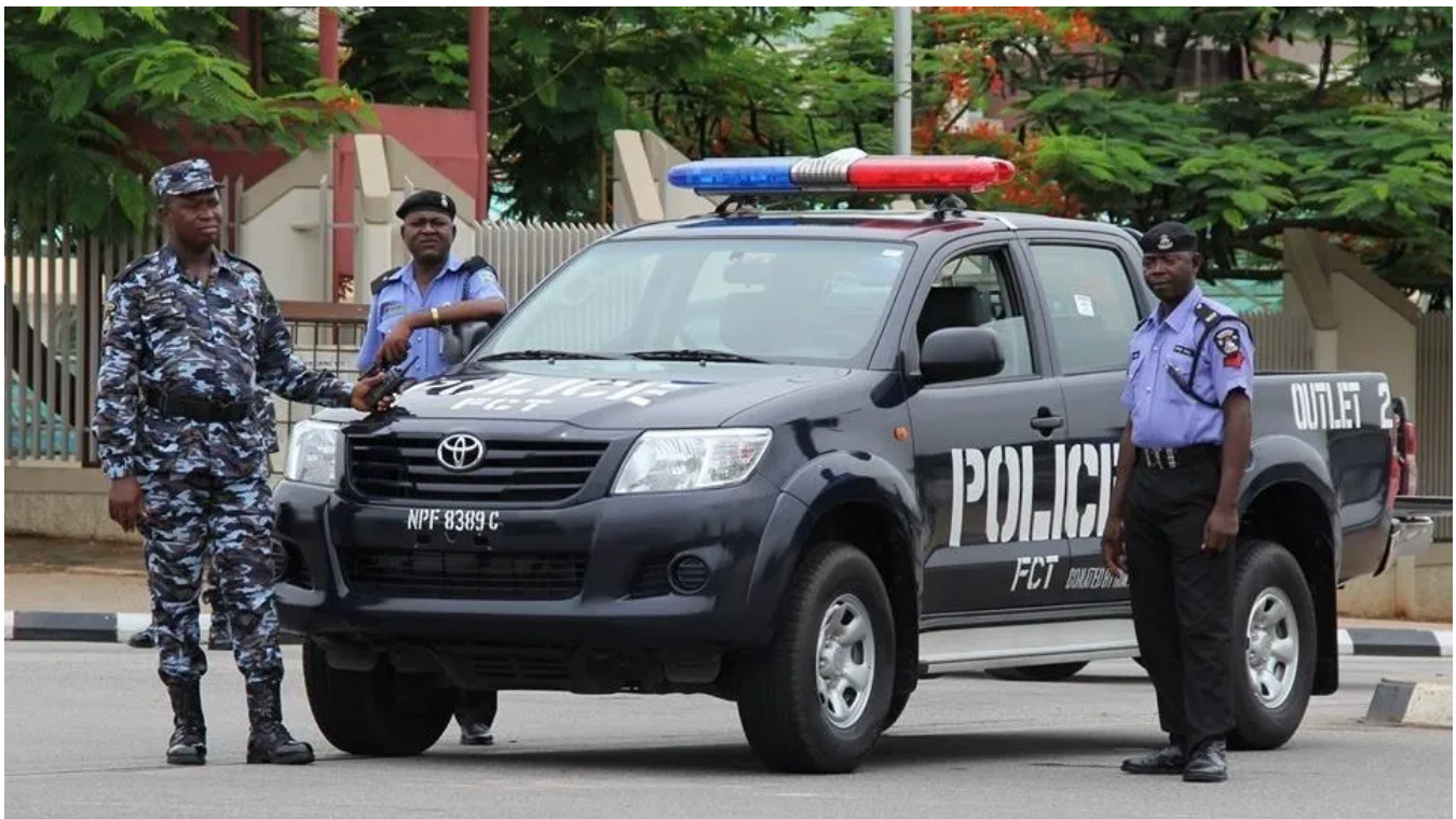
Nigeria Police officers on duty